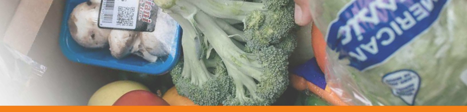
September - December 2020